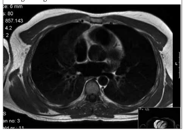
Figure 2. The heart MRI showed pericardial cysts along the right heart border

Surgical excision of pericardial cysts or percutaneous aspiration is, in general, only recommended in symptomatic patients<sup>2</sup> although if cysts are large as in our case, cyst removal should be considered because of the possibility of complications such as haemorrhage into the cyst with tamponade.<sup>13</sup>