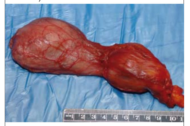
At the left side of the picture the testis is located and at the right side the spermatic cord leiomyosarcoma.

Leiomyosarcoma of the spermatic cord is rare, about 110 cases have been reported in literature.1 The clinical presentation is often an inguinal or scrotal mass, painful or painless, and is sometimes accompanied by a hydrocele. A review of paratesticular sarcomas in adults showed a peak incidence in the sixth and seventh decade. The most common means of spread is lymphatic, haematogenous (lung) and furthermore by local extension to the scrotum, inguinal canal or pelvis. Radical orchidectomy is the standard primary surgical procedure and the importance of adequate surgical margins has been well documented. To reduce local recurrence, adjuvant radiotherapy can be applied.<sup>2</sup> A reported survival rate is 50 to 80%<sup>3</sup> but probably half of the patients experience tumour recurrence.4 Therefore, thorough clinical and radiographical long-term follow-up is essential. In clinical practice, spermatic cord leiomyosarcoma, although rare, should be in the differential diagnosis for a firm palpable mass in the scrotum or inguinal region especially in older men.