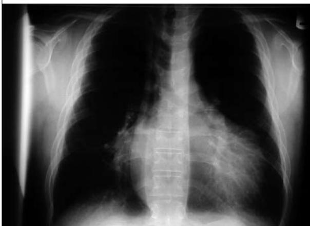
Figure 1. Anteroposterior view of the chest showing cardiomegaly