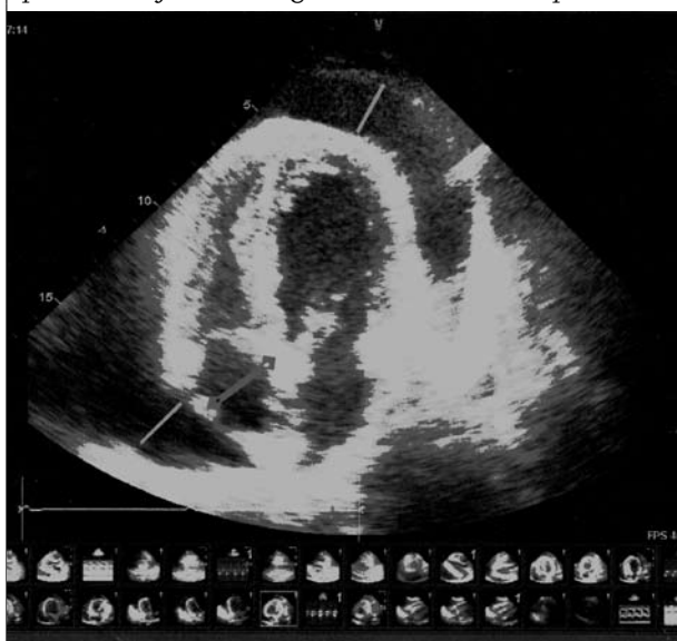
Figure 3. Echocardiograph showing large amount of pericardial fluid; the right atrium is not collapsed

The patient was then treated by levothyroxine with a starting dose of 50 µg/day. An improvement in symptoms, normalisation of the ECG ( figure 2B ), as well as the cardiac silhouette on chest X-ray developed after two months and the pericardial fluid disappeared.