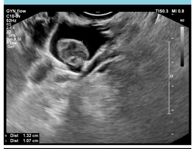
Figure 1. Pelvic ultrasound showing a 1.0 x 1.3 cm round echogenic structure on the right side of the uterus (upper panel) with absence of flow as confirmed by Doppler (lower panel)

Departments of Internal Medicine, <sup>2</sup>Gynaecology, <sup>3</sup>Radiology, Maxima Medical Centre, Veldhoven, the Netherlands. *Corresponding author: britt.van.erven@mmc.nl