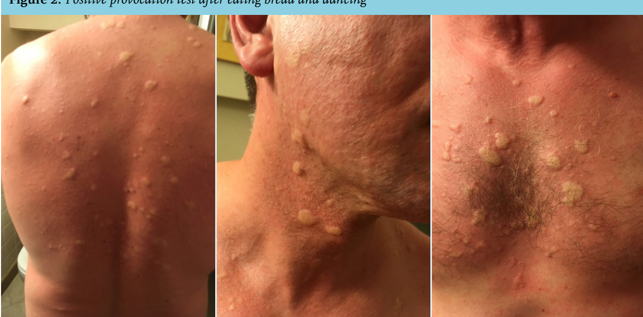
Figure 2. Positive provocation test after eating bread and dancing

In our patient we suspected exercise-induced anaphylaxis provoked by wheat (WDEIA) because he ate wheat before this anaphylaxis and the previous cycling trip when he developed urticaria. IgE against omega-5 gliadin can confirm WDEIA. Omega-5 gliadin is one of the most common allergens involved in WDEIA; approximately 80% of the patients have IgE reacting to omega-5 gliadin.<sup>4</sup>