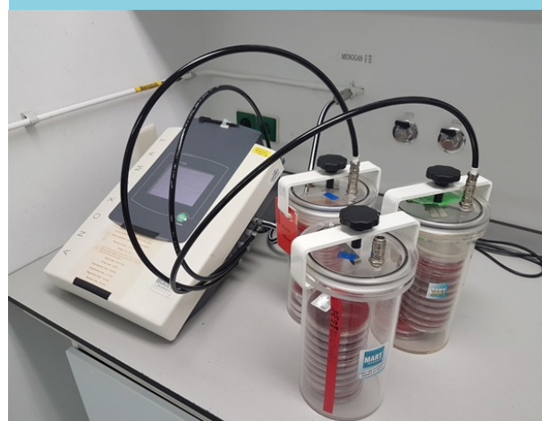
Figure 1. Microaerophilic incubation of H. pylori cultures and the Campylobacter jejuni ATCC 29428 as growth control by the Anoxomat (Mart Microbiology, Drachten, the Netherlands)

Resistance rates for antimicrobial agents commonly used to treat H. pylori infection were compared by Chi-square tests between the periods 2006-2010 and 2011-2015. Data are presented as numbers and percentages for each antibiotic separately. To estimate influence of selection