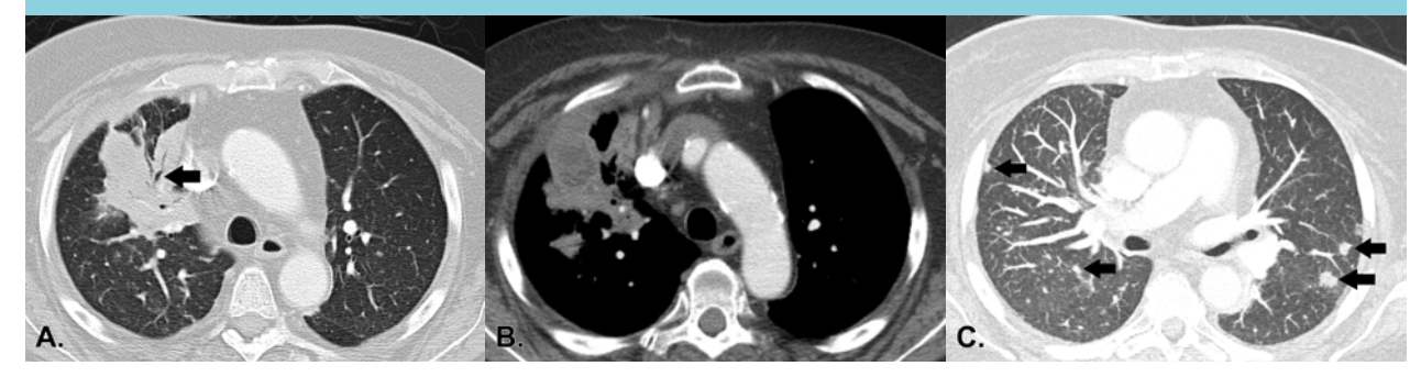
Figure 2. CT thorax. A. Lung parenchyma; B. Mediastinal setting showing a dense inhomogenous mass with partial atelectasis and suggestion of air bronchograms in the right upper lobe (arrow in A.); C. minimal intensity projection setting, 4 mm bilateral multiple dense nodules can be seen (arrows)