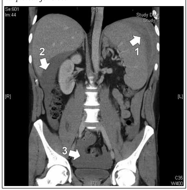
Figure 2. AP reconstruction of CT scan, showing an enlarged spleen with a subcapsular haematoma (arrow 1), a fluid collection between the liver and the right kidney extending in the paracolic area (arrow 2) and a fluid collection in the pelvic cavity (arrow 3), both suspicious for blood

The reported incidence of clinically confirmed splenomegaly in patients with infectious mononucleosis differs from 10-50%. <sup>1,6</sup> On ultrasound, 100% of patients show splenomegaly, with maximum enlargement in the second to third week of illness. <sup>1</sup> Splenomegaly develops due to infiltration of lymphoid cells into the red pulp, trabeculae, capsule and blood vessels. This leads to oedema, softening and weakening of the spleen parenchyma and capsule, with increased risk of rupture as result. Mild trauma or Valsalva manoeuvre can cause rupture.