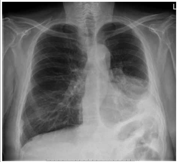
Figure 1. Chest X-ray suspicious for a central tumour with secondary pleural effusion and atelectasis on the left side

A 64-year-old male with a medical history of chronic obstructive pulmonary disease was referred by the ophthalmologist to the rheumatology department under suspicion of giant-cell arteritis (GCA). The patient presented with acute blurred vision related to bilateral retinal artery occlusions (RAO). Apart from an unintentional 25 kg weight loss, there were no other related symptoms such as headache, jaw claudication, fever, morning stiffness, nor pain and stiffness of the shoulder and pelvic girdle. At physical examination no abnormalities were discovered and pulsations of the temporal artery were normal with absence of tenderness. Laboratory tests revealed a raised erythrocyte sedimentation rate of 108 mm/hour, C-reactive protein of 122 mg/l and anaemia (haemoglobin 6.2 mmol/l). An electrocardiogram showed sinus rhythm. Because of the preliminary diagnosis of GCA and potential risk of permanent blindness, the patient was immediately treated with a high dose of prednisolone. However, a temporal artery biopsy did not confirm this diagnosis. The chest X-ray showed a central mass of the left lung with pleural effusion (figure 1). Computed tomography (CT) was performed.