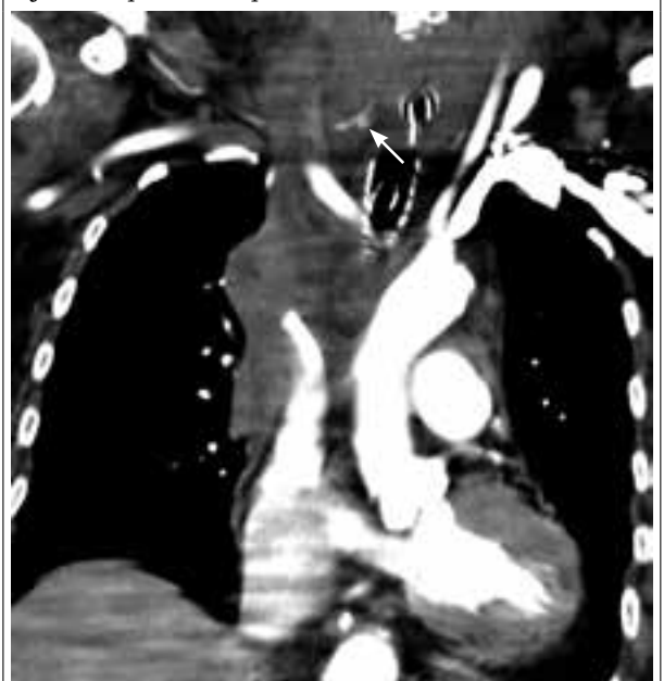
Figure 2. Computed tomography of the chest with contrast shows an active bleeding focus in the right inferior thyroid artery

the access site (most frequently) to the branches of the aorta along the route of the vessel, pseudoaneurysm, arterovenous fistula and thromboembolism.<sup>7-9</sup>