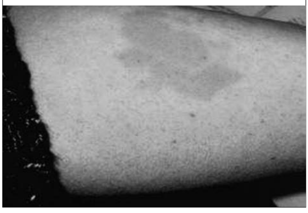
Figure 1. Patient's right forearm, 24 hours after five-minute ice cube application, still showing a localised urticarial rash

We studied cytokine production by peripheral blood mononuclear cells (PBMCs). Cells isolated from the patient and two healthy volunteers were stimulated for 24 hours at 37°C with lipopolysaccharide (LPS); supernatant concentrations of IL-1 \beta , TNF \alpha and IL-10 were measured by ELISA. This revealed no increased cytokine production by patient cells; rather, a trend towards less IL-1 \beta production ( figure 2 ). Incubation of the cells at a lower temperature (20°C) blocked cytokine production almost completely in both volunteers and patient. There was also no difference in cytokine production by patient cells isolated while symptomatic or symptom-free (data not shown). Serum IL-1 \alpha and IL-1 \beta concentrations were not increased.