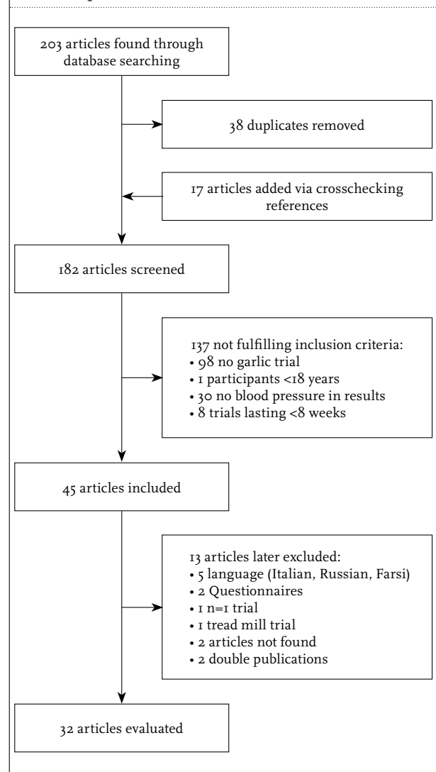
Figure 1. Flow diagram of the process of selecting clinical trials examining the effect of garlic ingestion on blood pressure

Different study designs were used; 21 double-blind, randomised, placebo-controlled, parallel trials; 15-17,20-21,25,27-28,30,32-39,42-45 two randomised placebo-controlled crossover trials; 40,41 one single-blind, placebo-controlled trial; 46 one double-blind, randomised trial against an active component; 32 six uncontrolled before-after trials; 18,22-24,26,29 one controlled before-after trial. 19 Only one trial was a priori set up in a randomised placebo-controlled fashion to test solely whether garlic lowers blood pressure in a hypertensive population. 16