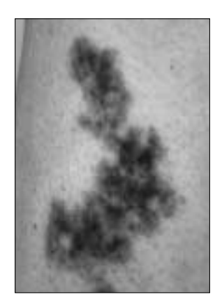
Figure 1 Cutaneous lesions of the lower legs of our patient (the plaster is there because of the biopsy taken from the lesion)