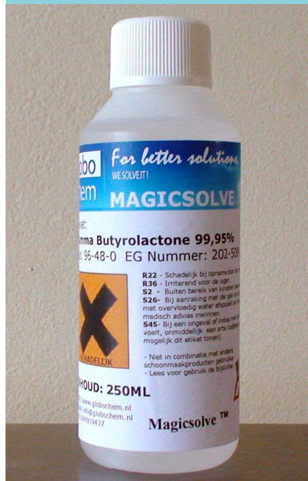
Figure 1. Example of a bottle with GBL

progressive dyspnoea for three days. She had no other relevant medical history. She reported no recent cold, fever, cardiac symptoms nor use of alcohol or illicit drugs. Her medication included benzodiazepines and