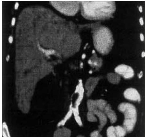
Figure 2 Gas-containing thrombus, localised at the aortic bifurcation

A colour version of these figures is available on www.njmonline.nl